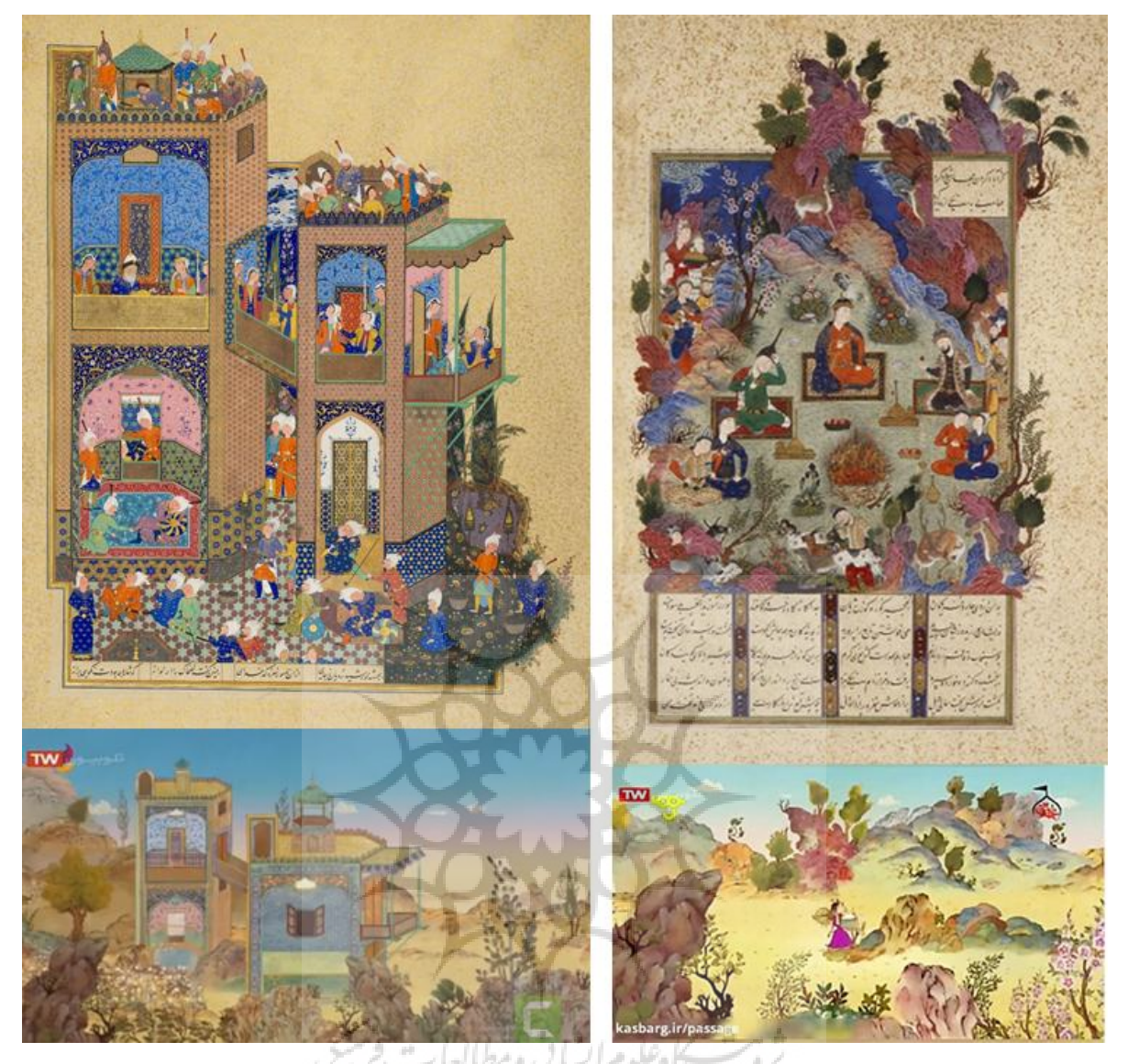
Fig. 2. Top left: Zahhak discusses his dream with Arnavaz. Shahnama (Book of Kings) of Shah Tahmasp. 1525–1535. Attributed to Mir Mossavvir. Tabriz. https://commons.wikimedia.org/wiki/File:Mir Musavvir 002.jpg Down left: A scene from the animation "Hezar Afsans" episode of Kerm Haftavad, which can be seen the use of visual elements of Zahhak discusses his dream with Arnavaz's Shahnameh of Tehamasbi in the building of background. Top right: The Feast of Sada", Folio 22v from the Shahnama (Book of Kings) of Shah Tahmasp. 1525. Attributed to Sultan Muhammad. Tabriz. https://www.metmuseum.org/art/collection/search/452111. Down right: A scene from the animation "Hezar Afsans" episode of Kerm Haftavad, which can be seen the use of visual elements of The Feast of Sada's Shahnameh of Tehamasbi in the rocks and plants of background.