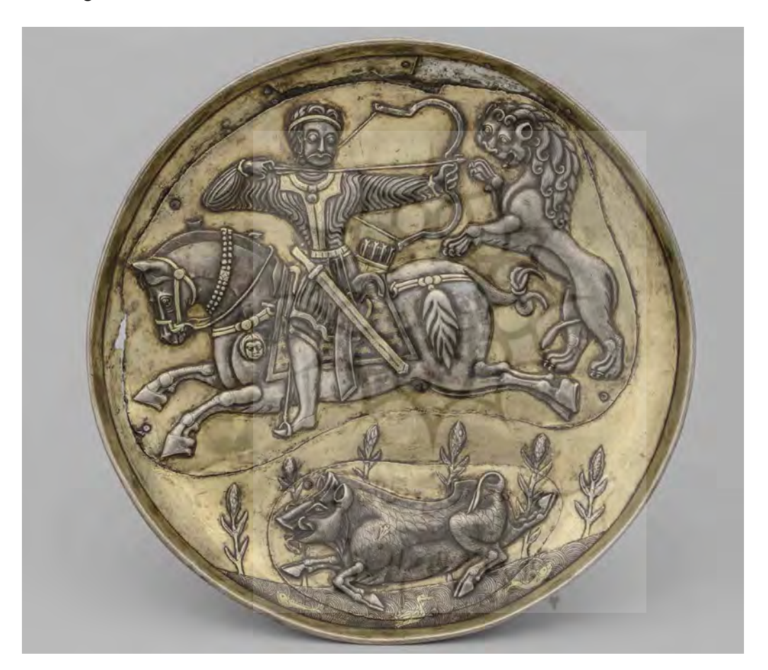
Fig. 6: Plate with a horseman hunting, 8th century, Sogd, The State Hermitage museum collection, № S-247.

Later, this would be the main feature of compositions on the famous Nishāpūr ceramics, where the main heroes were knights and birds (Shukurov, 2016: 74-75). The birds could be presented as different species though and knights could be shown either on foot or if mounted then on a horse not in motion, but within the same "ongoing bodily existence" (Shukurov, 2016: 74). On another famous silver bowl from the Hermitage Museum collection (Fig. 6), which according to the paleographic analysis seems to have been made not earlier than in the 7th century or, better in the 8th or 9th centuries (for literature summarizing the dates, see: Bollók, 2015), the hunting composition continues in the familiar manner of showing a frontal hunter, sitting on a "galloping horse" and shooting backward.