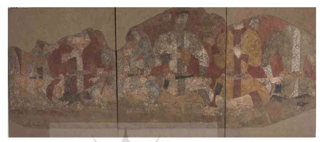
Fig. 1: A fragment of a mural "Merchants feasting", first half of the 8th century, Panjikent, Sogd, Room 10, Sector XVI, The State Hermitage museum collection, №CA-16216.

Belenitsky as "The merchants", from a domestic sanctuary of a rich man's dwelling in Panjikent (Room 10, Sector XVI) shows feasting people dressed in gorgeous Chinese silk garments and armed with small thin daggers (Fig. 1). The daggers are fastened to their belts together with purses, narrow cases, and small pieces of fabric (Expedition Silk Road 2014: 183).