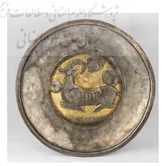
Fig. 5: Plate with ibex, 8<sup>th</sup> century, Sogd, The State Hermitage museum collection, № S-1.

The composition leaves no space and its main heroes seem to be "flying" over the universe, marked just with a tree and/or water, feeding it (Fig. 3), but the same tendency is seen on the silver plates that were made in Great Khorāsān (Fig. 5).