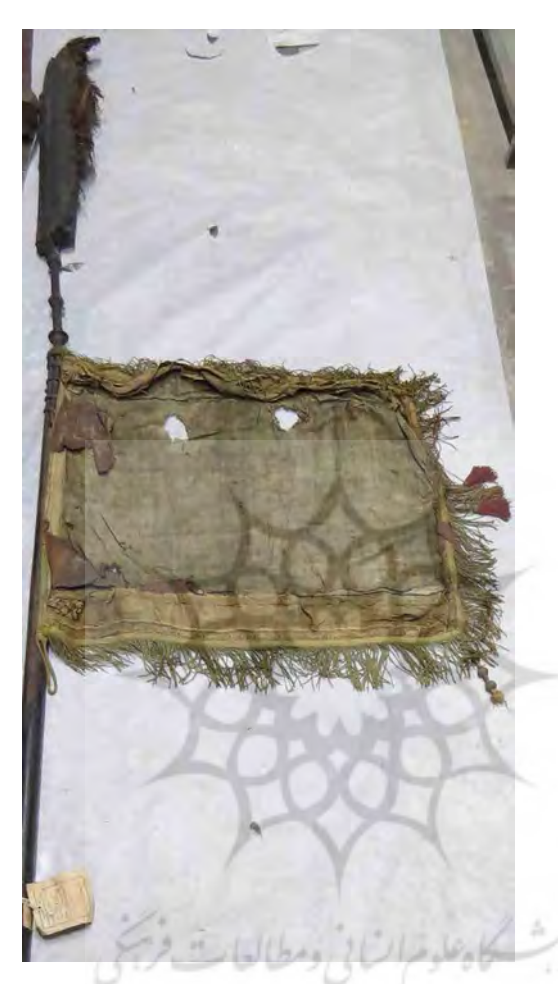
Fig. 8: A banner, Iran, 18th-19th centuries. The State Hermitage museum collection, №3H 5371.

Its appearance makes us think that the item was used as an 'alam finial. It is one of the oldest pieces of such a type that appeared in Russia approximately in the late 18th century. It is noteworthy that later, it was attached as a finial to quite a long pole along with a Persian banner of the early Qajār era (Fig. 8) (Malozyomova, 2016: 85-89).