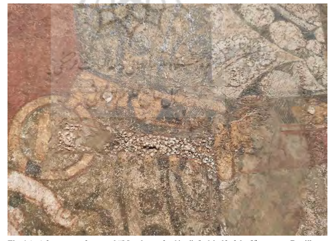
Fig. 1 A: A fragment of a mural "Merchants feasting", first half of the 8<sup>th</sup> century, Panjikent, Sogd, Room 10, Sector XVI, The State Hermitage museum collection, №CA-16216. Detail.

The hilts of these daggers were represented with a thick layer of paint resembling rough ray skin. This is an indication of the status of the dagger wearer (Fig. 1A).