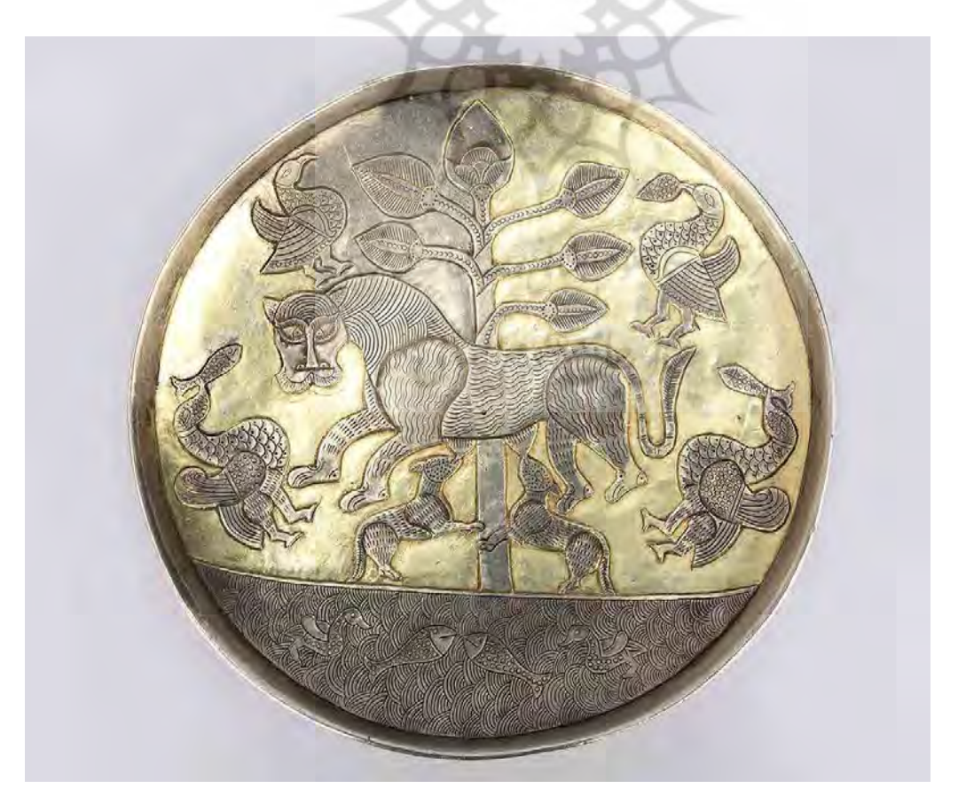
Fig. 3: Plate with a lioness and lionets, 7th-8th centuries, Iran, The State Hermitage museum collection, № S-22.

Simultaneously, these particular artifacts by themselves were connected with the upper classes as al-Tabarī, mentioned that silverware and silk garments from Herāt and Marv were given as honorary gifts (al-Tabarī, 1989: 1636). Textile production is also linked with military culture. Citing al-Maqdisī, Zhukovsky states that "The Best Divisions in the Knowledge of the Regions"/ "Ahsan al-taqāsim fī ma'rifat al-aqālim" written in 985 CE reminds 1300 cloaks as a part of a tax from Marv. What time this tax belongs to it is difficult to say (Zhukovsky, 1894: 25), but it was not later that the second half of the 10th century. Silverware, cautiously dated to the early Muslim period, contains next to the images of pseudo-sīmurgh, other scenes that were common in previous times. These scenes show either a hunting or combat scenario between a predatory bird and a quadruped animal and represent the relevant concepts for the upcoming periods with their royal and knighthood ideas. Another actual idea was the continuity of generations (that is the "abna" concept"). This is probably why the image of motherhood is shown in the gilded silver bowl (Fig. 3). This last concept was also underlined in the verses of Iranian poets (Shukurov, 2016: 69-70).