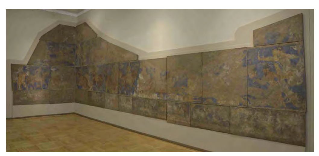
Fig. 2: A fragment of a mural of "Blue Room", Ca. 740, Panjikent, Sogd, Room 41, Sector VI, The State Hermitage museum collection.

to the post-Islamic period, written in the Sogdian language (Azarpay, 1981: 95-97). There was a separate cycle of these narrated stories in Eastern Iran in the pre-Islamic period (Shukurov, 2016: 72), while Panjikent itself was a city of not only commercial importance, but military and political significance as well (Azarpay, 1981: 95-97).