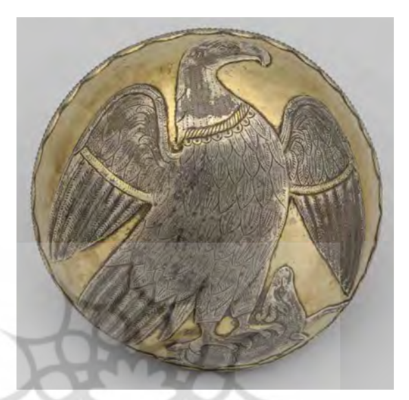
Fig. 4: Plate with an eagle and gazelle, 7th-8th centuries, Iran, The State Hermitage museum collection, № S-298.

The preserved silverware dating to the early Muslim time points to the evident continuation of the traditions, but the changes as well (Lukonin, Trever 1987: 98-99). Along with stylized variants of represented characters and the general tendency to symmetry, the way the compositions were organized was quite special – a scene or its main hero (a kind of eagle in combat scenes, for example) is trying to occupy almost the entire space of the object, usually shown on traditional bowls and plates (Fig. 4).