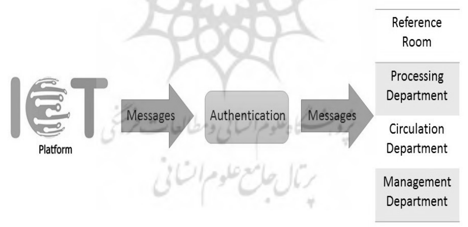
Fig.2. IOT Platform

In smart libraries all objects and devices can connect to each other and can gather information from the entire thing inside and outside of libraries. These new technologies called Linked Data technology (Roy, 2015). IOT technologies also present golden opportunities for libraries to connect their resources and services to more users, and more devices, at any time of the day. A complete smart system needs hardware, software, connectivity and user interface. IOT Platforms can facilitate communication, data stream, device management and functionality of applications. Recently, many companies try to create IOT platforms according to needs of their clients such as Microsoft Azure IOT, GoogleClud Platform, Watson IOT, Samsung Electronics Launched Artik, Thing Worx IOT Platform, Amazon Web Services (AWS) IOT. Fig. 2 shows the suitable IOT platform for academic libraries.