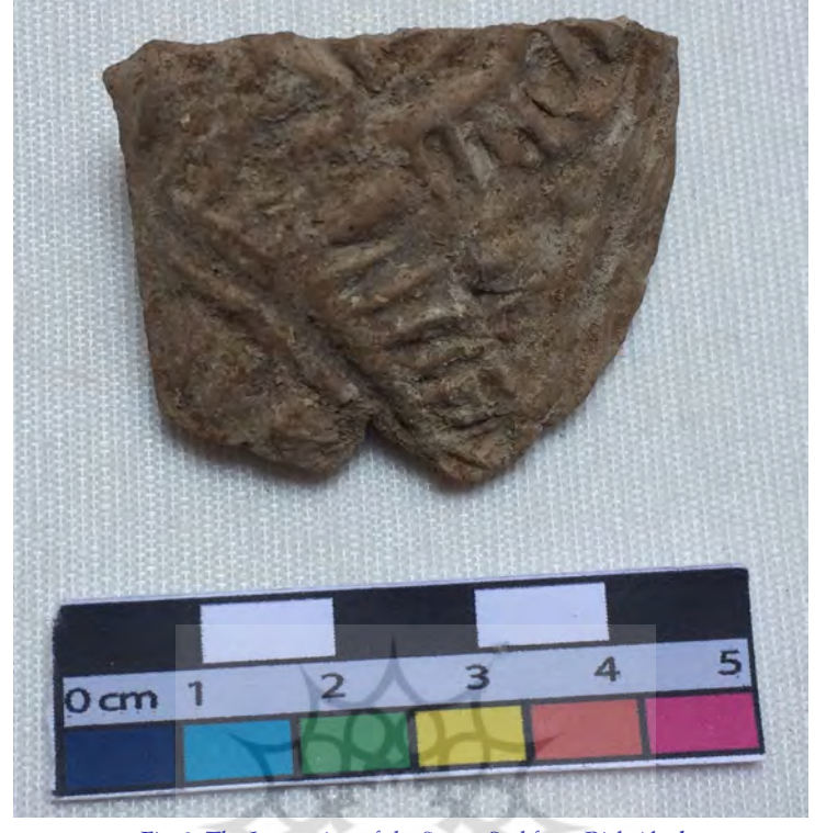
Fig. 3. The Impression of the Stamp Seal from Rick Abad.

nal place and has been moved there later. The height of this wall is 61 cm and its length in the trench is 1 meter. The width varies from 30 to 35 cm, and due to the looseness of mud-bricks, their dimensions are not determined. In a large part of the trench, signs of ash and burns (probably due to the presence of a thermal structure) can also be seen.