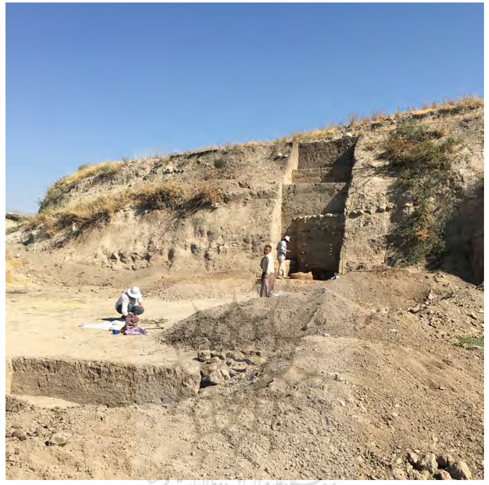
Fig. 2. Tepe Rick Abad Viewed from the South (Trench A and B).

2.6 meters, respectively. These remains are probably part of a square mud-brick structure. A number of animal bones, pottery fragments, and a gray flint chip with 2.7 cm in diameter are the most important findings of this level.