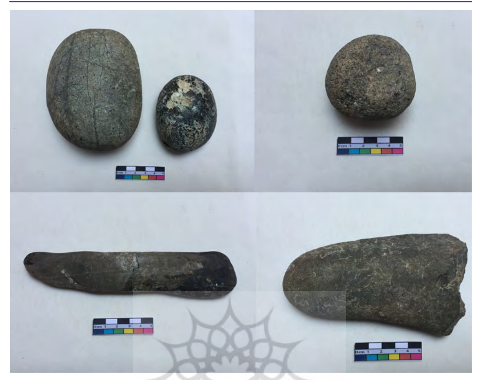
Fig. 4. Some of the Stone Implements from Rick Abad.

wall is 2.5 cm and its interior is covered with a layer of ash and charcoal, especially on the upper area.