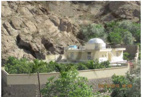
Picture no (1) a second home in Foudije village