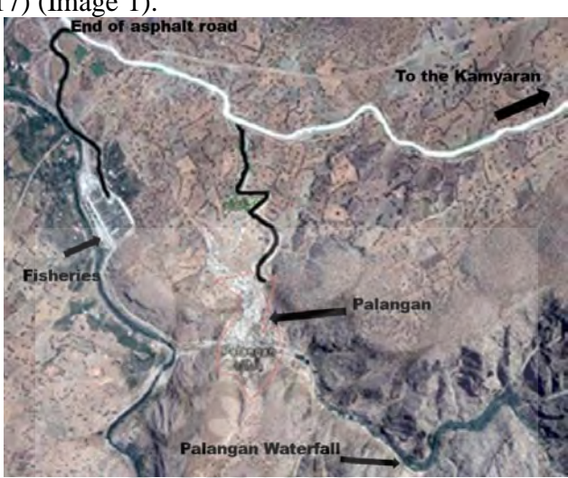
Image1: Palangan geographical location

castle of Hassanabad in Sanandaj around 16000 AD (around 980 solar and 1010 Lunar) has been the head of the Ardalan government for more than 400 years. Palangan was the center of the Ardalan government before the time of Haloo Khan Ardalan (969-995) (Zandi, Najafi, 2017) (Image 1).