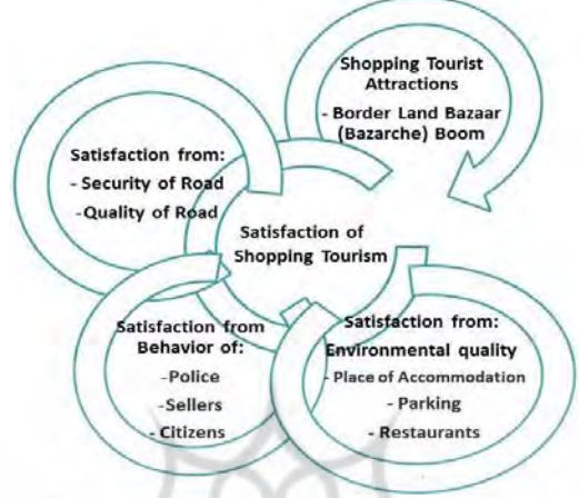
Diagram 1: conceptual Model: Authors

According to what discussed above, this paper investigates the different dimensions of the related issue using conceptual model.