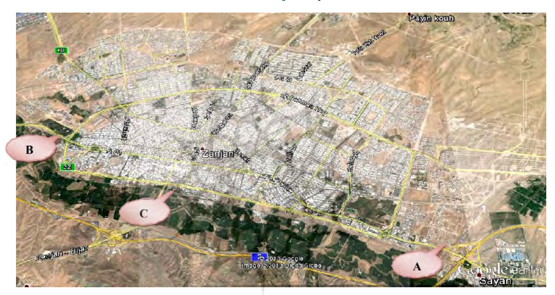
Fig. 2: Location of Zanjan's city entrances