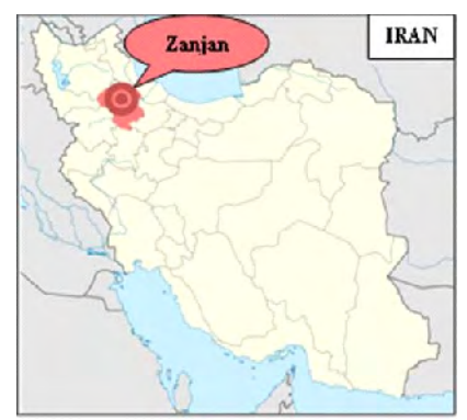
Fig 1: Location of Zanjan Province in Iran (Source: Yar-Shater, 2008)