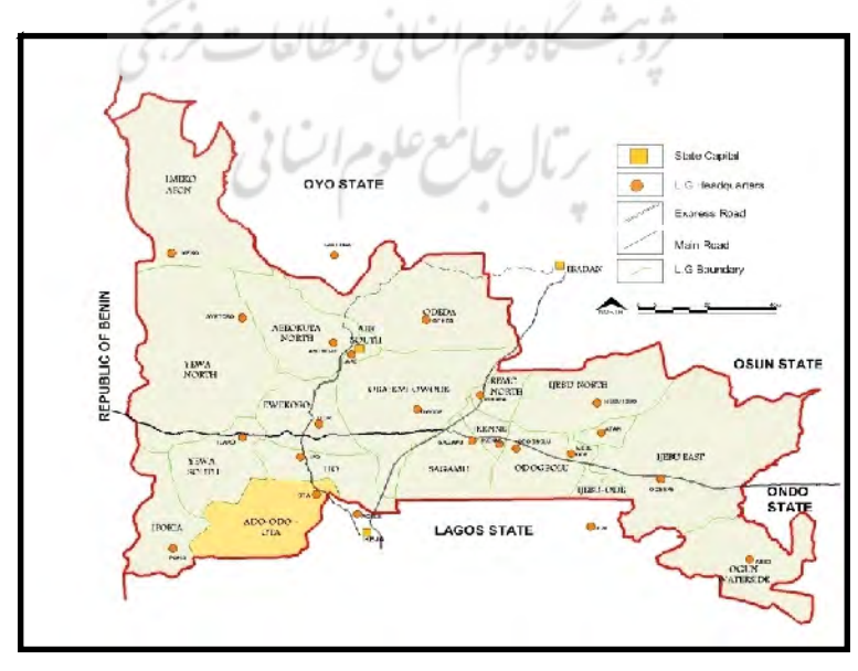
Fig. 1: Map of Ogun State showing Ota Township

Commercial activities in Ota take place in a linear form along the major arteries of Lagos – Abeokuta Expressway, Ota – Ijoko Road and Ota – Idiroko Road. The transport system in Ota consists essentially of road network, thus making the town accessible only to road traffic. Ota is highly accessible in terms of regional linkage and connectivity to other parts of the country and beyond. The internal road system consists of some trunk roads, township roads and local streets. The road and drainage system of Ota is poor given