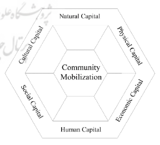
Fig. 2: A Framework for Sustainable Community Development. Sustainable development requires mobilizing citizens and their governments to strengthen all forms of community capital. Community mobilization is necessary to coordinate, balance and catalyse community capital.