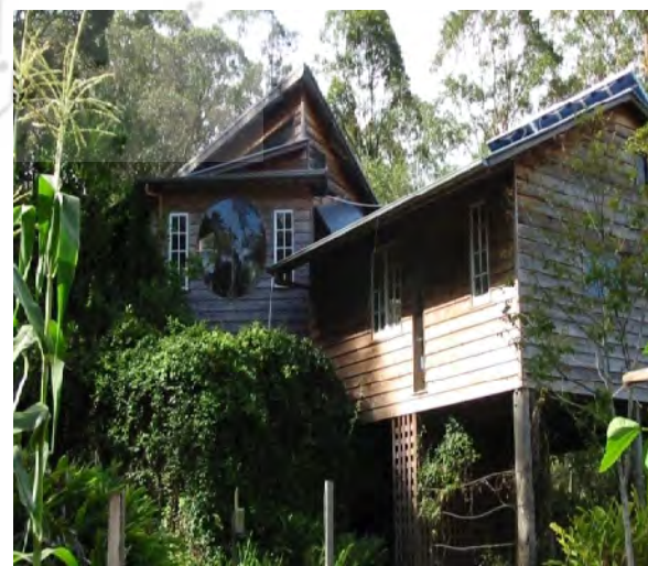
Fig.10: Solar house at crystal waters