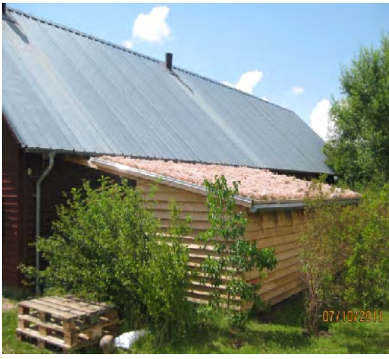
Fig.12: Use of green roof in Munksogaard

Instead of using traditional energy-intensive materials, Munksøgaard is committed to integrating organic, low-tech building materials into its new development projects (Ibid).