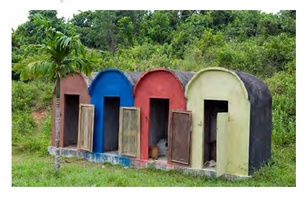
Fig.6: The edge of town recycling station emptied monthly in Sarvodaya