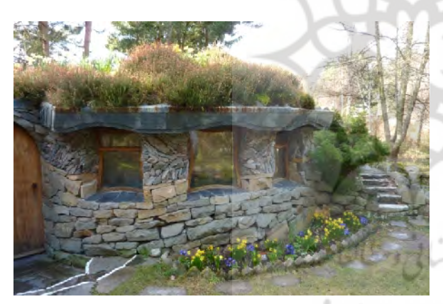
Fig.1:One house in Findhorn Evo-village.

Following the Gilmans report, representatives from some of the communities and other people with a global social interest, met in Denmark in 1991 to discuss a strategy for developing