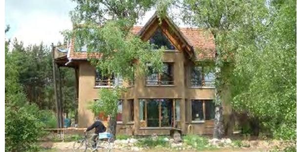
Fig.18: One Type of buildings in Sieben linden