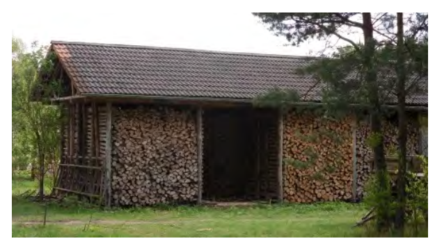
Fig.17:Fire wood from forests of Sieben linden