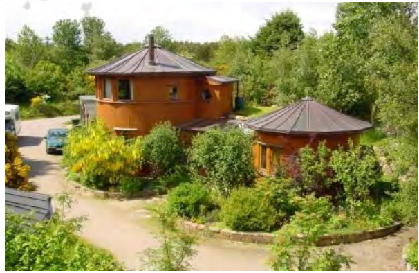
Fig.3: Some buildings in Findhorn Eco-village