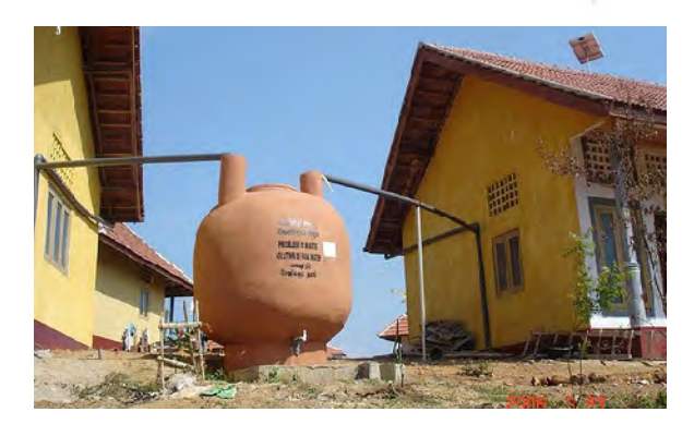
Fig.5: Capture of rain water in Sarvodaya

Crystal water: Another permaculture village is Crystal water. It is Located 100 km (62 mi) northeast of Brisbane, Crystal Waters Permaculture Village is a community of 83