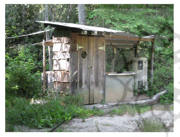
Fig.7: Hydroelectric Power Plant in Earthaven

These local waste management practices help preserve the environment by reducing transportation trips and alleviating