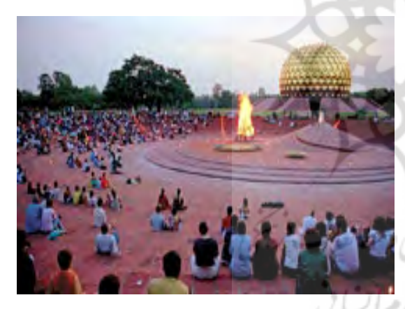
Fig.15: Peace Area of Auroville

Composting toilets and a traditional Russian sauna (Lazutin and Vatolin,2011,27-29). Currently more than 40 families