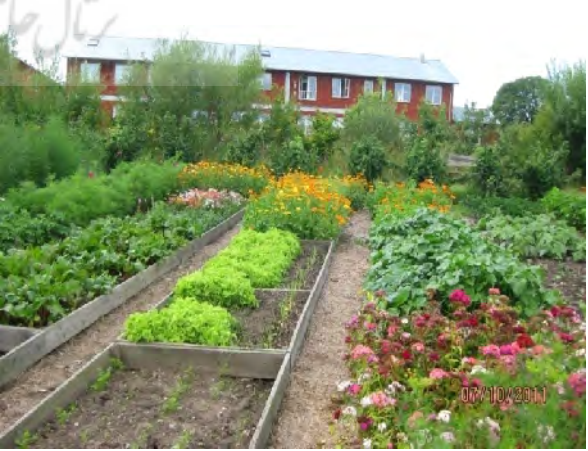
Fig.14: Gardens in Munksogaard