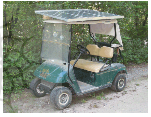
Fig.8: Golf car with batteries charged by solar panels in Earthaven