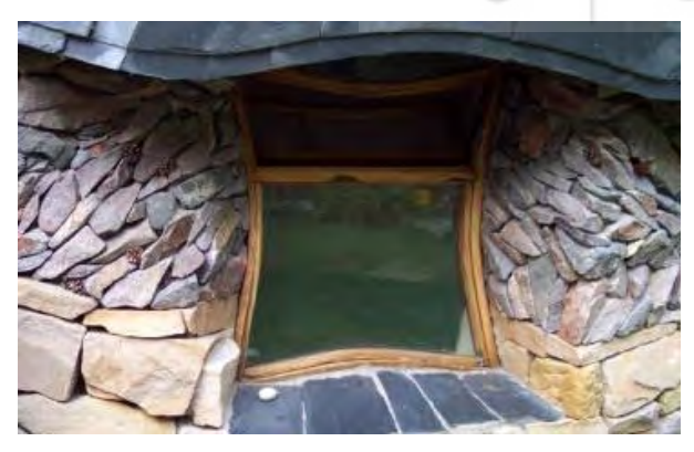
Fig.2: Type of windows in Findhorn eco-village

Sarvodaya designed and introduced for 55 poor tsunami affected families. It was started in2006. A feature of this