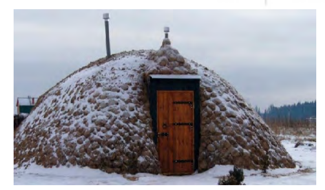
Fig.20: Cellar for winter supplies in Kovcheg

Use of recyclable, local and non toxic materials is very important. Material must have the ability to use multiple times.