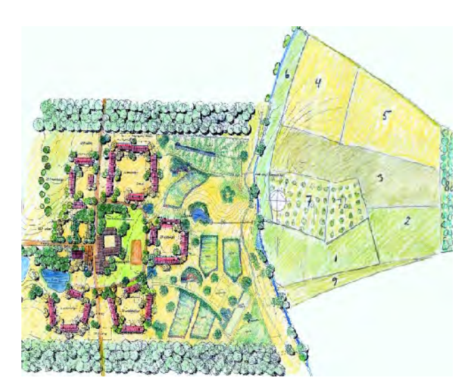
Fig.11: Site plan of Munksøgaard

pressure on existing waste treatment facilities (Ibid).