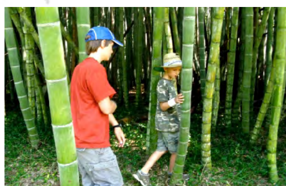
Fig.21: Use bamboo in Crystal water