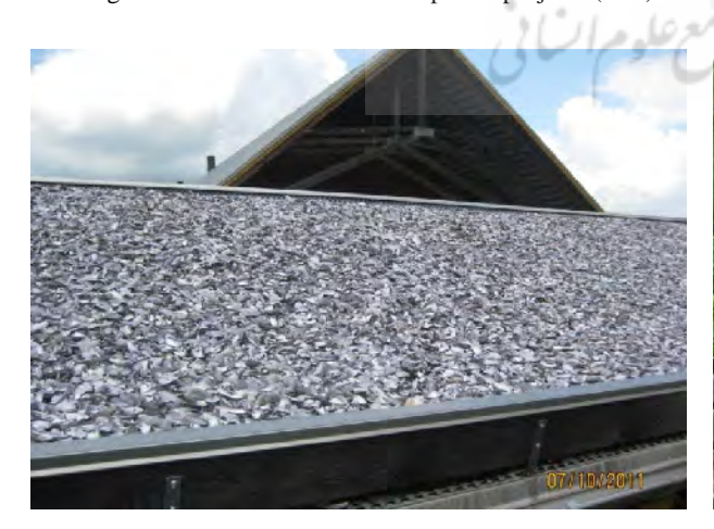
Fig.13: Use of mussel-shells in roofs of Munksogaard

Some ecovillages have a cultural or spiritual impulse as their main focus. At Findhorn, the centrally placed Universal Hall can hold 500 people and is used for big celebrations, cultural performances, meditations and seminars. In