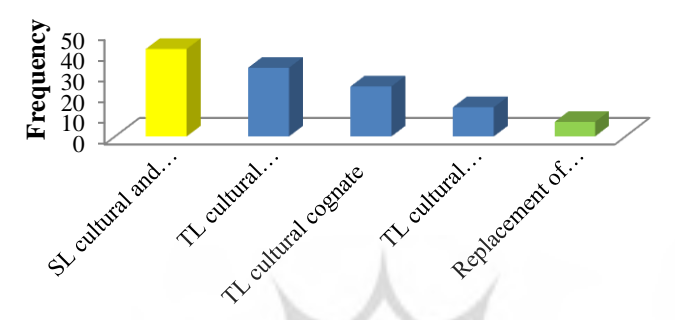
Type of Translation Strategy