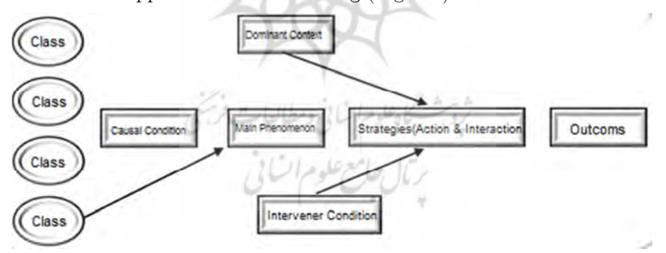
Figure 1. Paradigm model in the data theorizing (Krsul, 401: 2005)

model for streamlining the strategy in organizations, its goals are mainly achieved through exploratory and qualitative studies. In order to achieve the goals of this research, the data theory has been used. In other words, the present research, in order to overcome the shortcomings of past research, with a qualitative approach and using the method of data theory, edit a comprehensive model including causal factors. intermediary factors, and background factors to identify the effective factors on readiness to adopt internet technology with qualitative approach. Targeted sampling is used to sample which is an improbable sampling method. Also, theoretical sampling was used to adequately sampling. Deep interviewing was used as the main tool for collecting data. This interview is a form of unstructured interview that actually creates the richest data and often provides some amazing evidence. In order to validate the categories and their relationships, the researcher has tried to correct the theory regularly with frequent returns to the research data that is the continuous interaction between what is known and what should be understood. MAXQDA software is used to analyze qualitative data and theorizing. The main technique for data analysis in the research approach of data is coding (Figure 1).