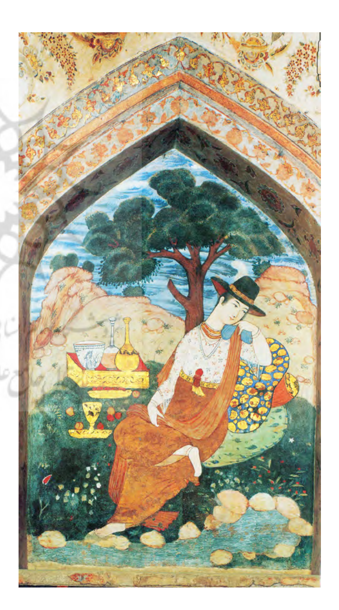
Fig. 1. Fresco, Chehel Sotoun Palace, School of Isfahan.

painters of the Renaissance, which is more manifested in Fig. 3. That is to say that geometrical and triangle frames that are considered different as an aesthetic indicator. In fact, "The aesthetics system of Iranian ancient miniature, which was broken off in the school of" Isfahan" will be replaced by an incomplete naturalism in paintings of Mohammad Zaman. He uses the achievements of the Renaissance artists in an arbitrary and artificial way and therefore his artworks lack accurate principles of perspective, perspective (graphical) of atmosphere, adjusting light and shade and the anatomy. On the other hand,